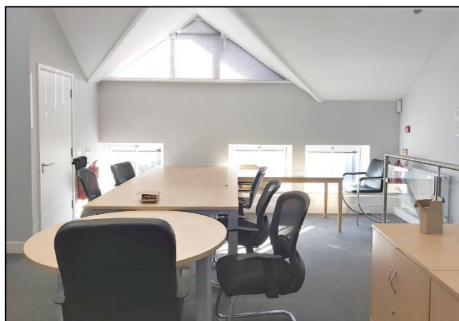
Second Floor Main Office