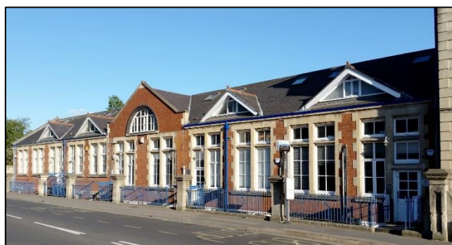
1-5 Kelso Place from Upper Bristol Road (A4)