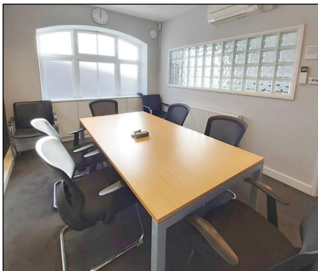
Bookable Meeting Room