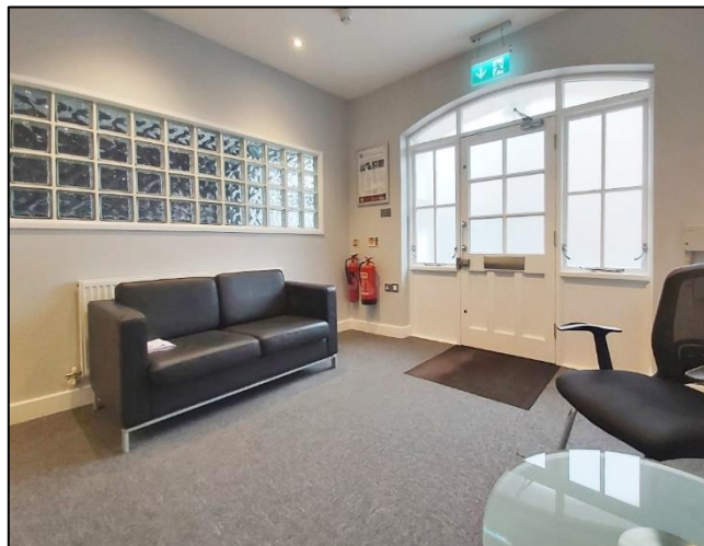
Ground Floor Entrance/Reception