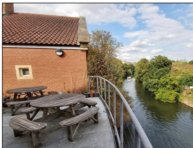
Terrace between North and South Offices