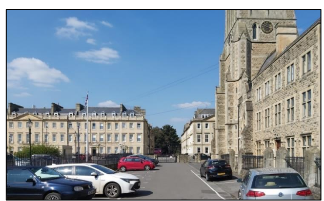
St John's Court BA2 4AF